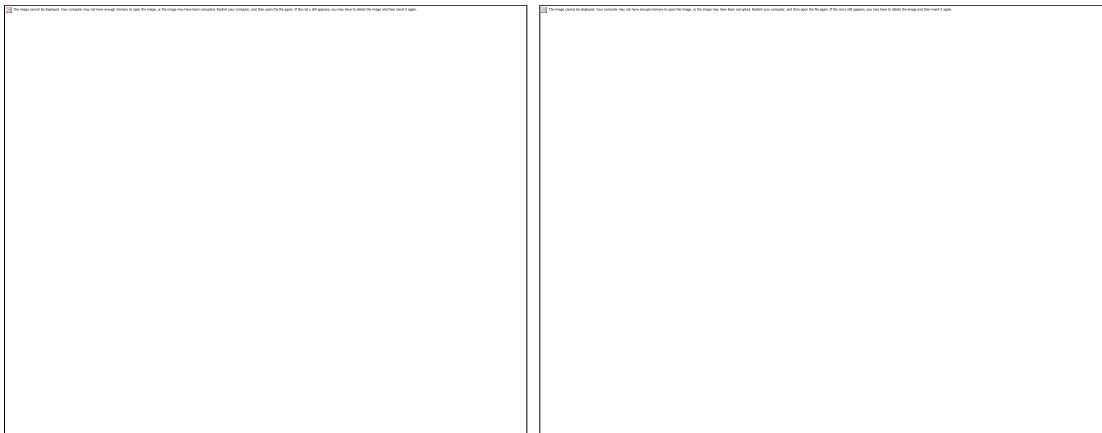
Figure 1. Bangalore Citizenship Indices 2007 and 2010

The 2007 data ranges from -7.13 to 27.97, and the 2010 data ranges from -7.43 to 17.01. The mean of both datasets is zero. Both datasets are slightly skewed at the lefthand side of the distribution. This result occurs when we apply the theoretical framework to combine the electoral knowledge and participation components with the civil knowledge and participation components. In both sets of data electoral knowledge and participation components present a normal positive distribution. In particular electoral participation is high. Approximately 90% of respondents vote in local, state and national elections.